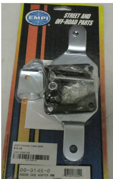
Engine Case Adapter 8mm