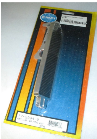
Billet aluminum gas pedal assembly