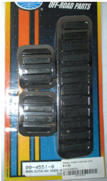
Brake,Clutch,Gas custom covers